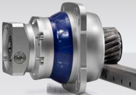
Maximum freedom in design