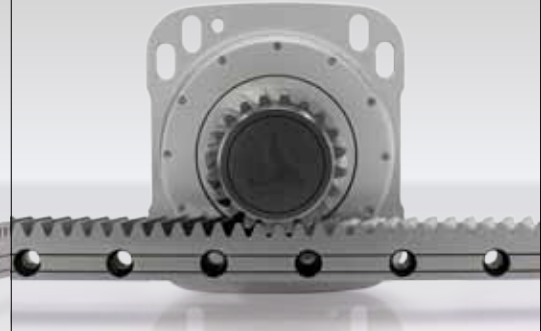
The High Performance Linear System convinces also with many design features.