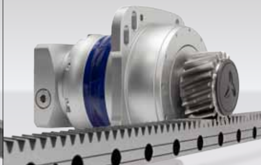
50% less labor required for installation