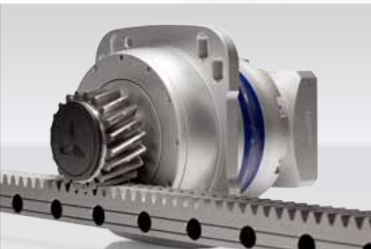
Gearhead, rack, pinion from a single source

The RP+ gear system is also available in an RPM+ Actuator version. The RPM+ Actuator is exceptionally dynamic, even more compact and perfectly suited to linear applications that use rack and pinion systems. In the motor version, maximum power density and functional design are fused into a unit featuring visible length benefits with an even more compact design! The motor ensures plus performance – the special design of its permanently activated actuator provides maximum power density at all times.