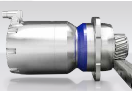
The High Performance Linear System is also available in combination with the Actuator RPM+.