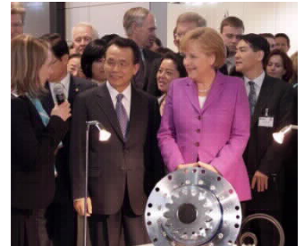
2009: Chancellor Merkel visits the WITTENSTEIN booth at the Hanover Fair