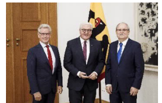
The inventor team nominated for the Deutscher Zukunftspreis 2018 with German President Frank-Walter Steinmeier.