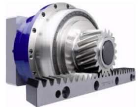
TPM+ servo actuator with rack and pinion