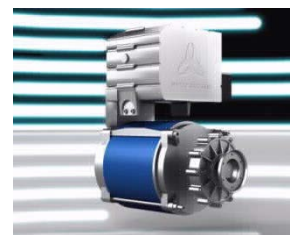
A vision for the future: highly compact electric drive system