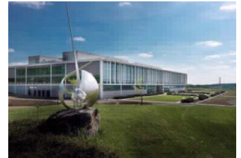
The WITTENSTEIN Innovation Factory is officially opened in May 2014 in Igersheim-Harhausen.