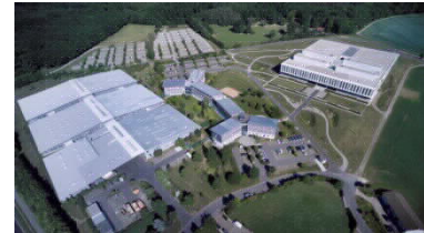
WITTENSTEIN SE headquarters in Igersheim-Harthausen

In 1999, the Group is able to celebrate yet another topping-out ceremony – in only three years, floor space in Harthausen is more than doubled with the erection of a development and sales centre, a training and communication centre, a second production and assembly shop and a new logistics hall.