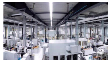
View of WITTENSTEIN bastian's new "Future Urban Production" facility in Fellbach