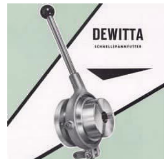
DEWITTA quick-release chuck