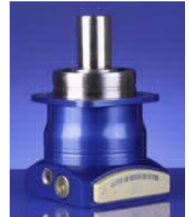
A vision of the nineties, realized in 2003: the intelligent alpheno® IQ gearhead

On September 29, 2016 the name of WITTENSTEIN AG changes to WITTENSTEIN SE and the company is henceforth operated as a European Company.