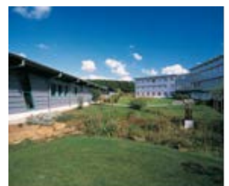
WITTENSTEIN SE World Garden in Igersheim-Harthausen