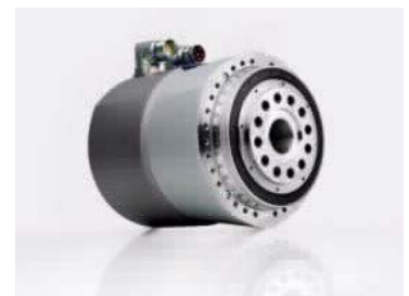
HERMES AWARD 2015