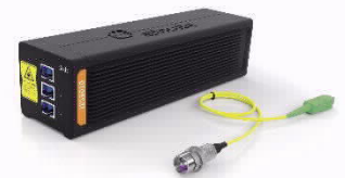
Optical sensor IDS3010 for measurement in the nano range