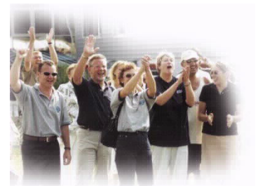
Now and then: the company's most important capital are the people who work for it