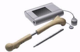
WITTENSTEIN intens FITBONE® for lengthening human limbs

Products made by the WITTENSTEIN Group's seven Business Units are typically used in robotic systems, machine tools, packaging, conveyor systems and process technology, paper and printing presses, medical technology and stage and lifting technology. Parallel to this, niche markets such as the aerospace industry, drive technologies in or on the human body and offshore extraction of natural gas and oil under the ice sheet of the Norwegian Sea are systematically targeted.